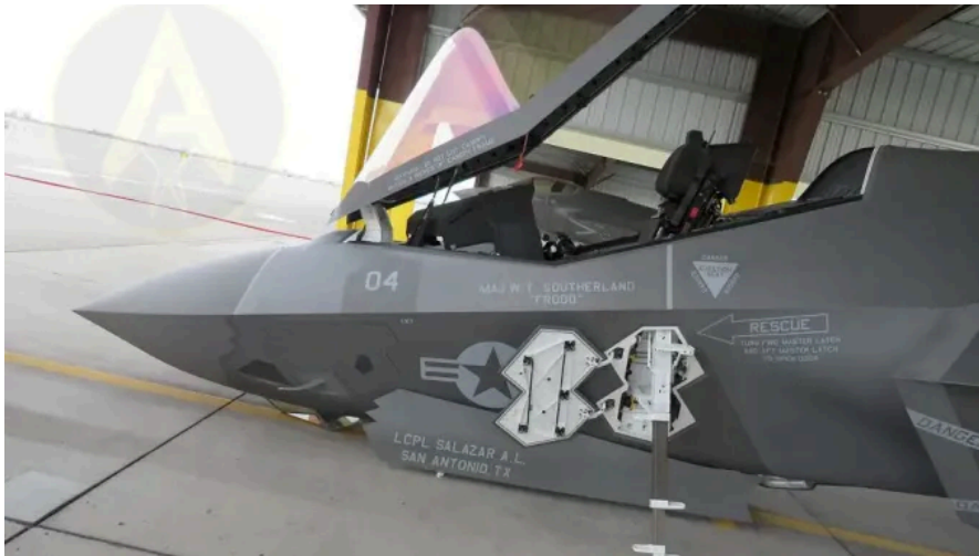
A close-up of the nose of the aircraft resting on the EOTS.

The pilot was climbing out of the F-35C when the nose landing gear began retracting.