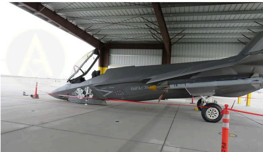
The F-35C sitting on the EOTS after the nose landing gear collapse.

We reached out to NAS Fallon PAO for confirmation and further details but, at the time of writing, we haven't received an answer yet, despite several attempts.